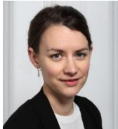
Dawson Cornwell the family law firm